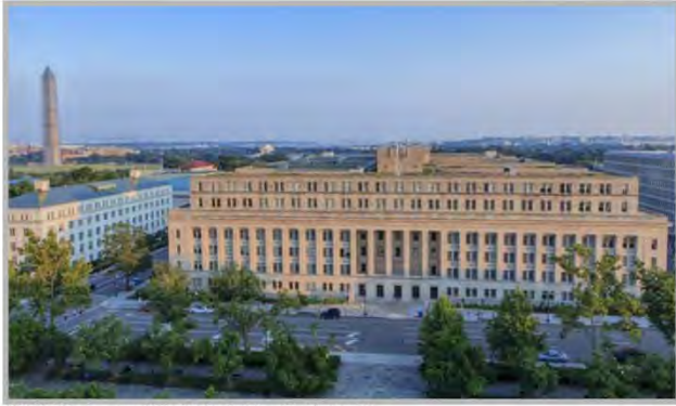
OSMRE Headquarters, Main Interior Building, Washington DC